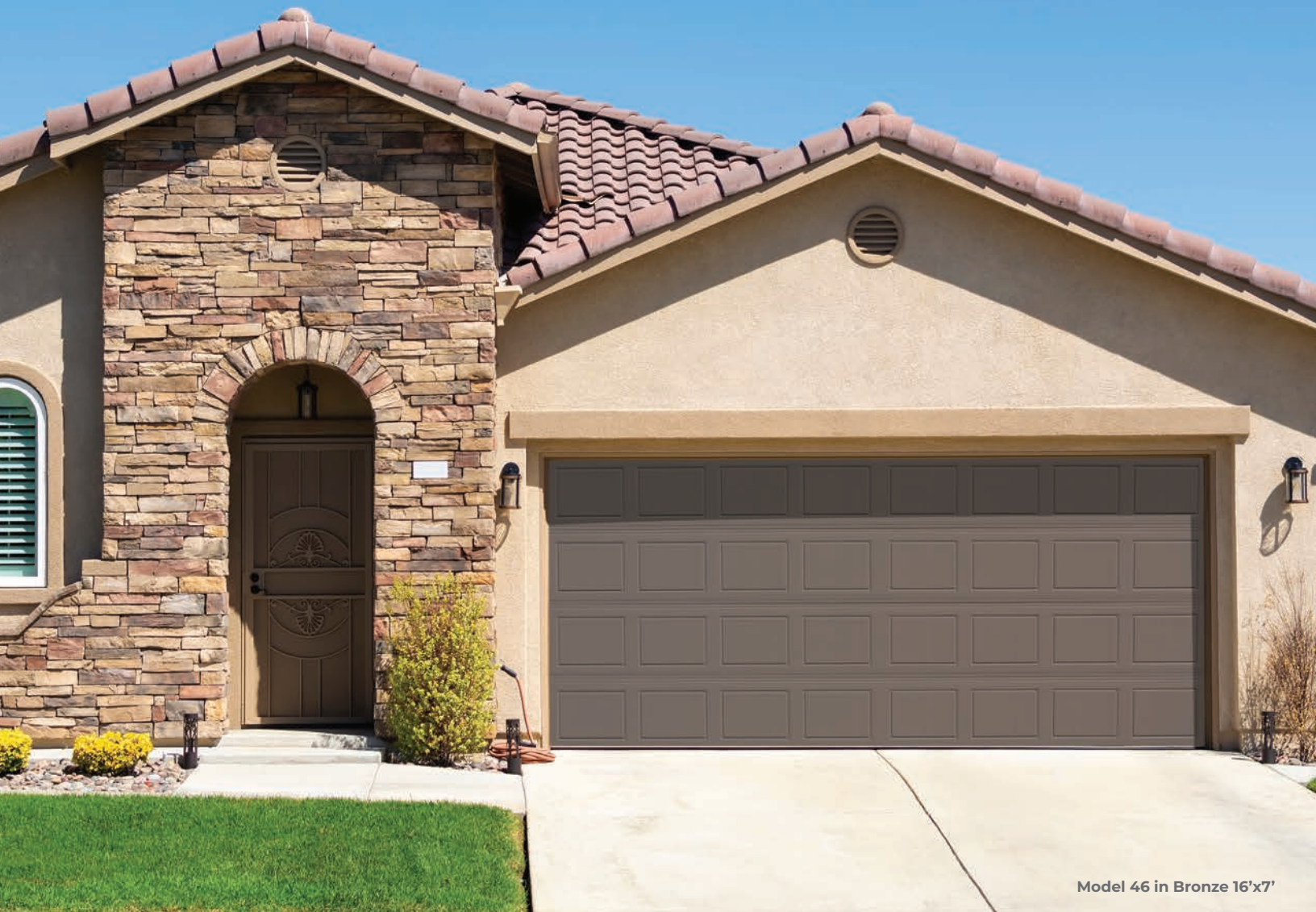
Model 46 in Bronze 16'x7'